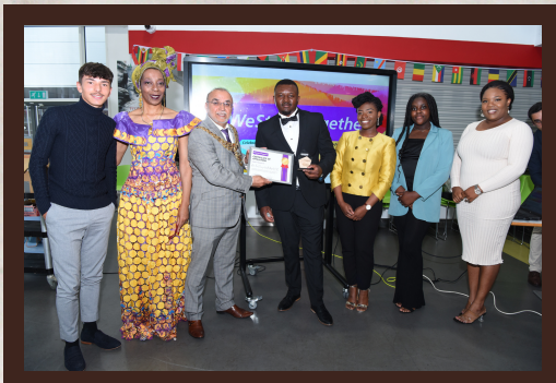
Be The Change Youth Project is in Manchester, United Kingdom. May 31 at 8:28 AM